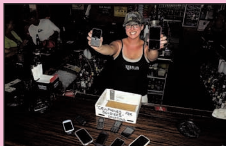
Cell Phones for Soldiers