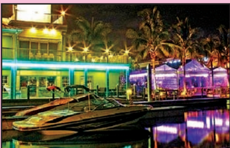
Dining in or taking out on Fort Myers Beach